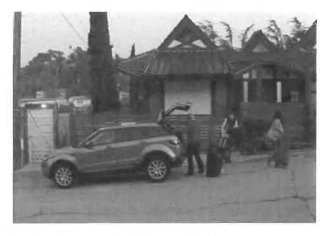
11/10/14 A group of renters unloading Luggage at the rental.