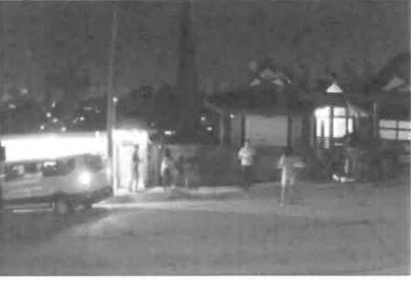
I was able to do a screengrab from a video to capture the latest renters. They tried to open a neighbors gate by mistake.