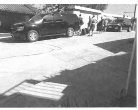
Renters are parked in front of another neighbor's garage and also in the rental's driveway.