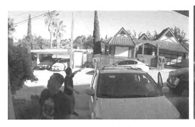
10/25/14 This photo shows the renters mistakenly in MY driveway asking to unload their luggage.