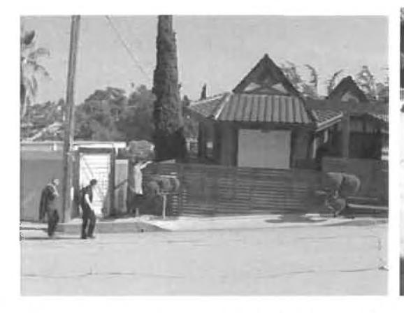
3 business men entering the lower level of the rental. The house is split into two even though it is R1.