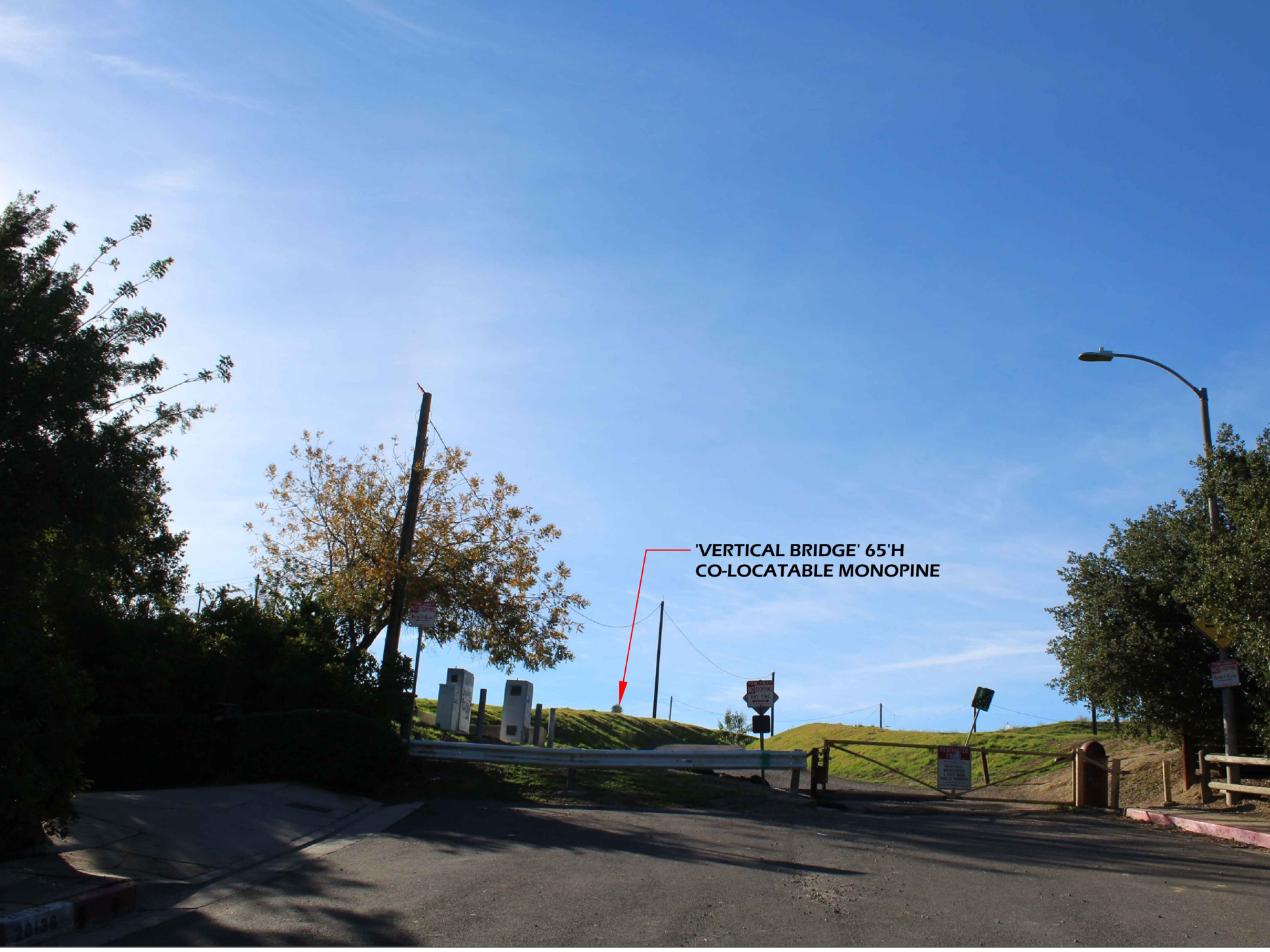
DISCLAIMER: THIS IS A RENDERING REPRESENTATION OF THE PROPOSED PROJECT ONLY