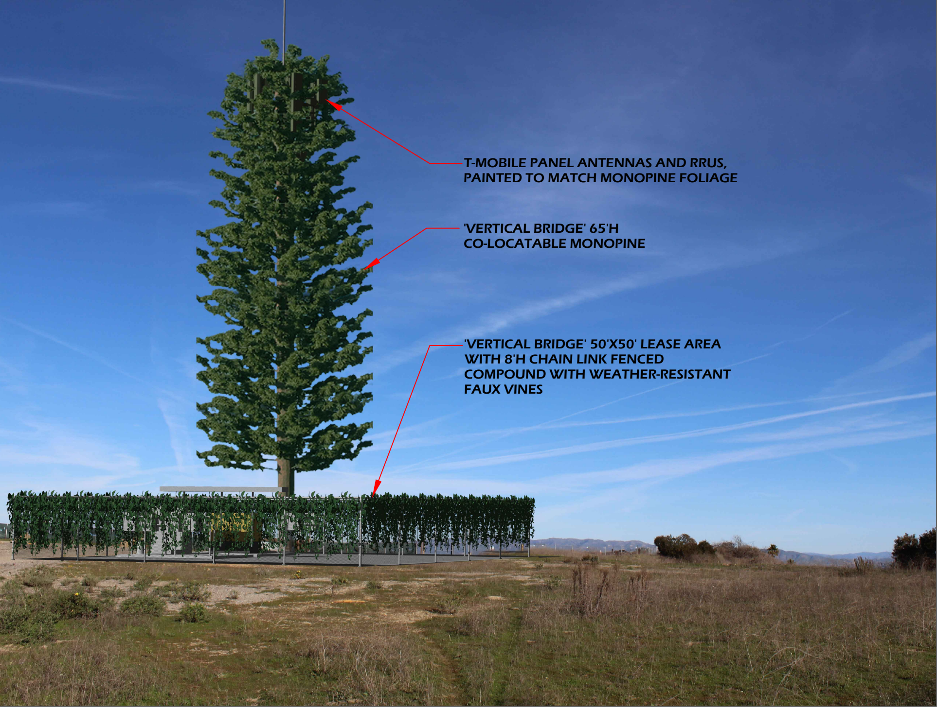
DISCLAIMER: THIS IS A RENDERING REPRESENTATION OF THE PROPOSED PROJECT ONLY