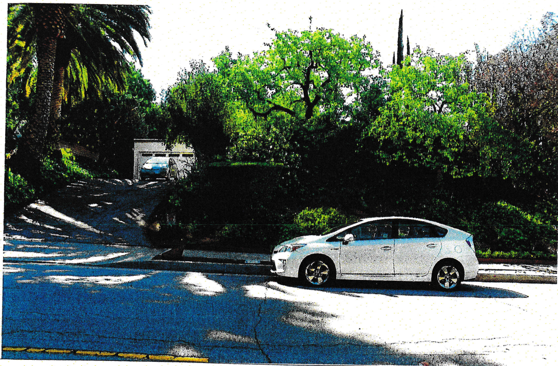
SUBJECT PROPERTY ①