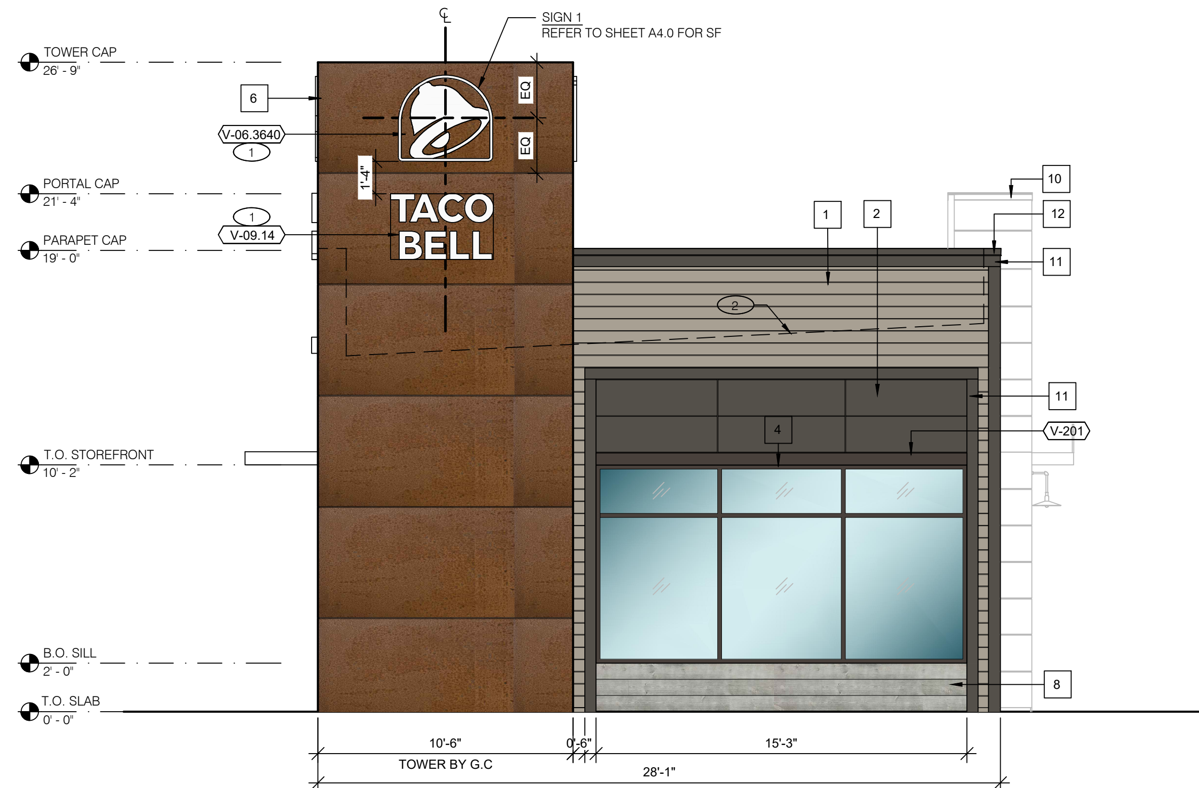
FRONT ELEVATION 1/4" = 1'-0" 3