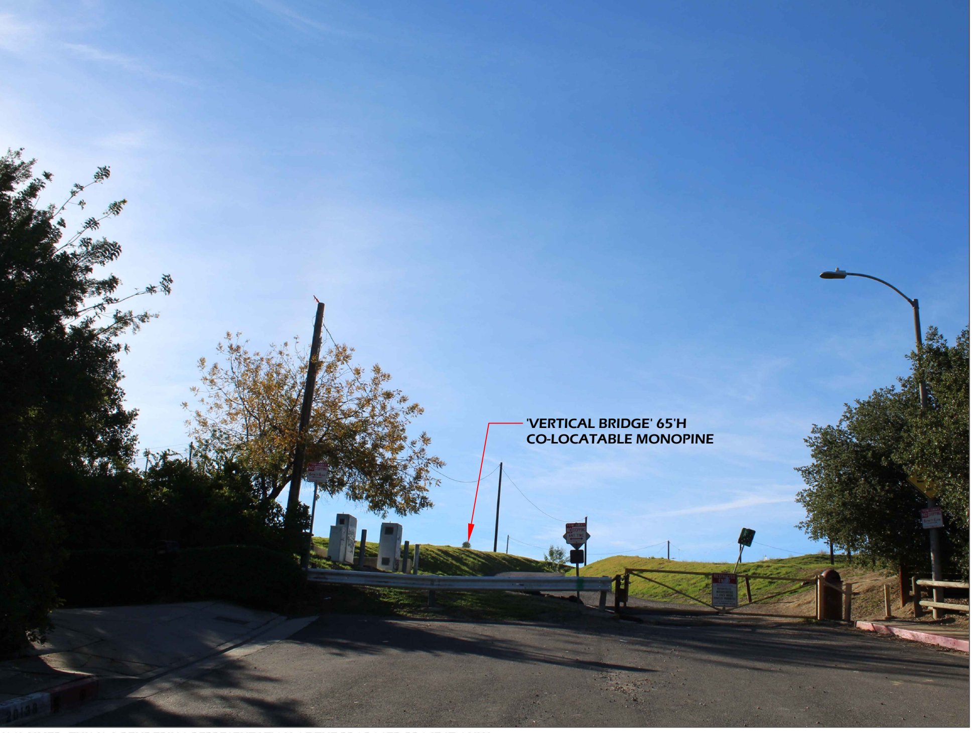
DISCLAIMER: THIS IS A RENDERING REPRESENTATION OF THE PROPOSED PROJECT ONLY