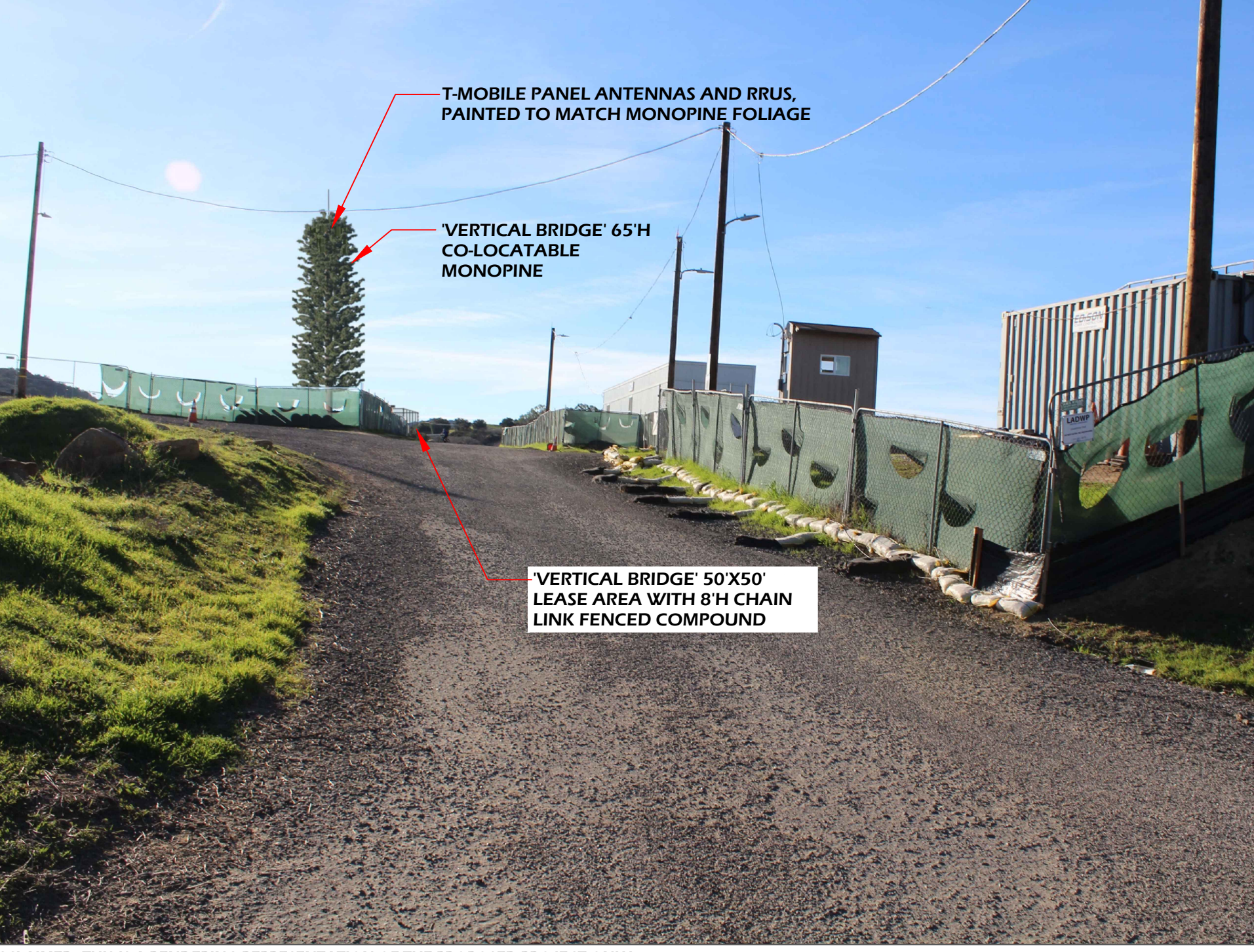
DISCLAIMER: THIS IS A RENDERING REPRESENTATION OF THE PROPOSED PROJECT ONLY