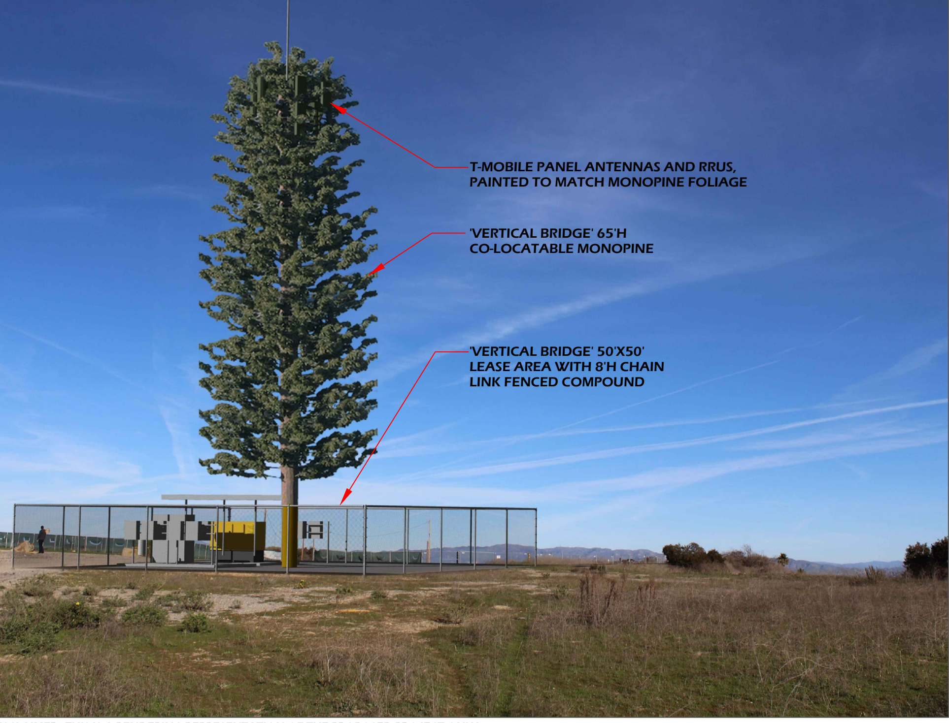
DISCLAIMER: THIS IS A RENDERING REPRESENTATION OF THE PROPOSED PROJECT ONLY